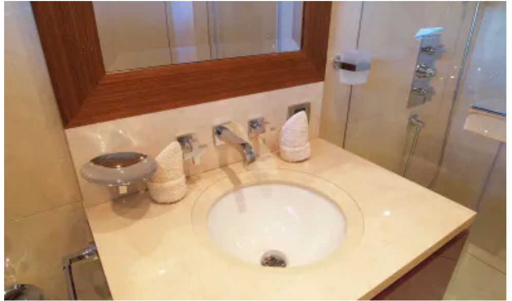
Double Cabin Bathroom