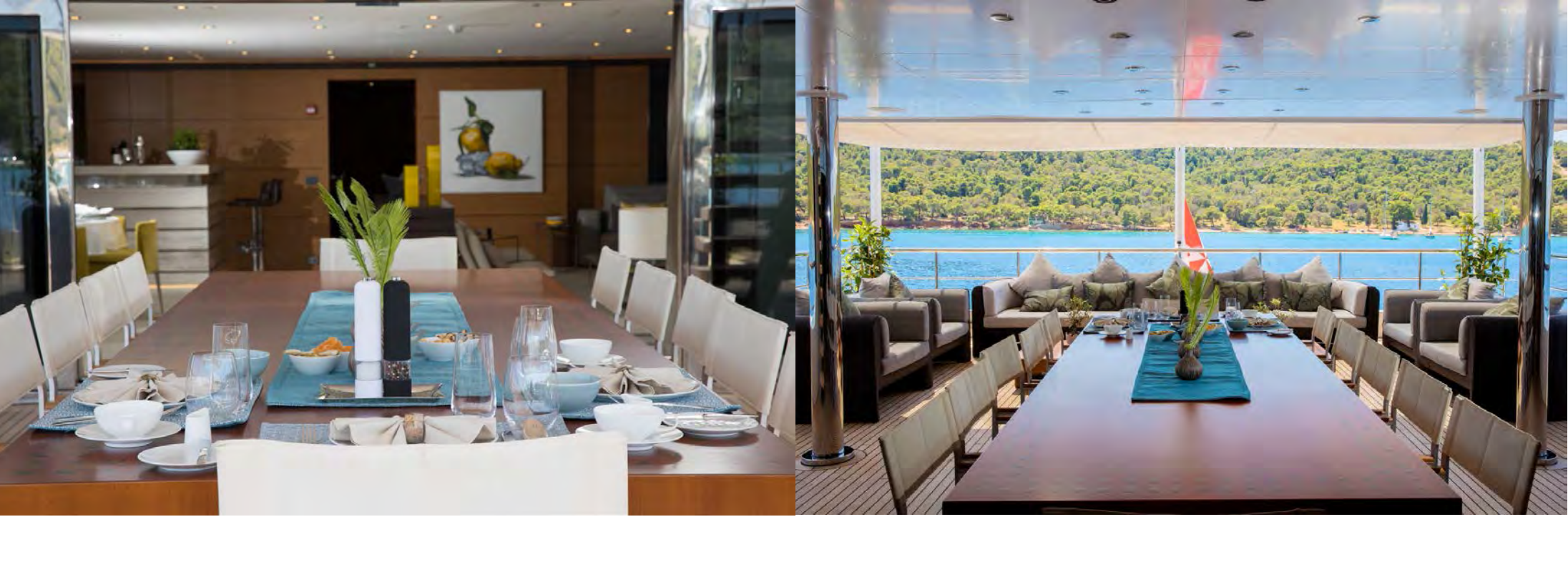
UPPER DECK LOUNGE AREA