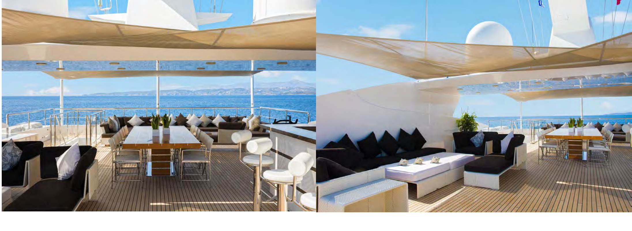
SPACIOUS DECK AREAS